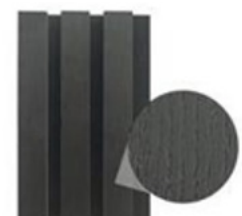
Natural Black Oak